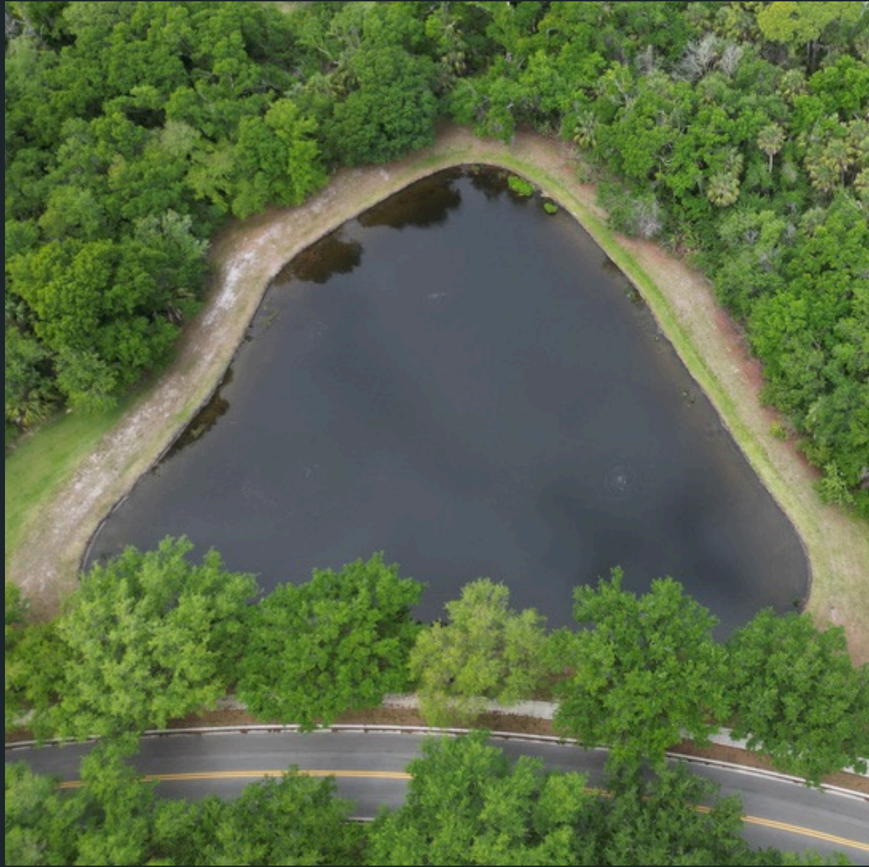
Pond #8 Treated for Shoreline Vegetation.