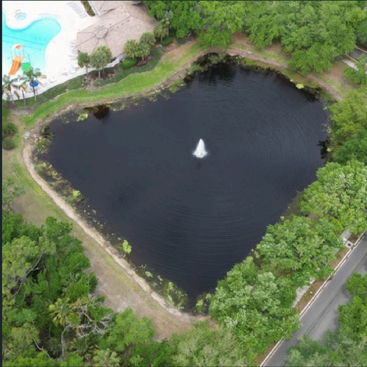
Pond #49 Treated for Shoreline Vegetation.