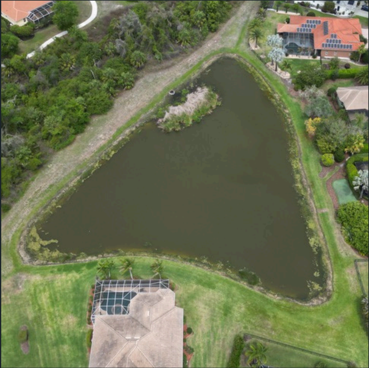
Pond #22 Treated for Algae and Shoreline Vegetation.