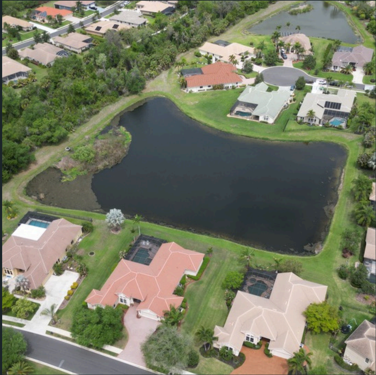
Pond #21 Treated for Shoreline Vegetation.