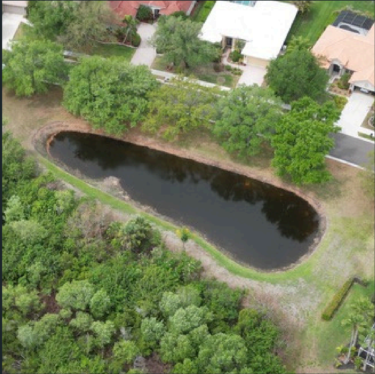
Pond #6 Treated for Algae and Shoreline Vegetation.