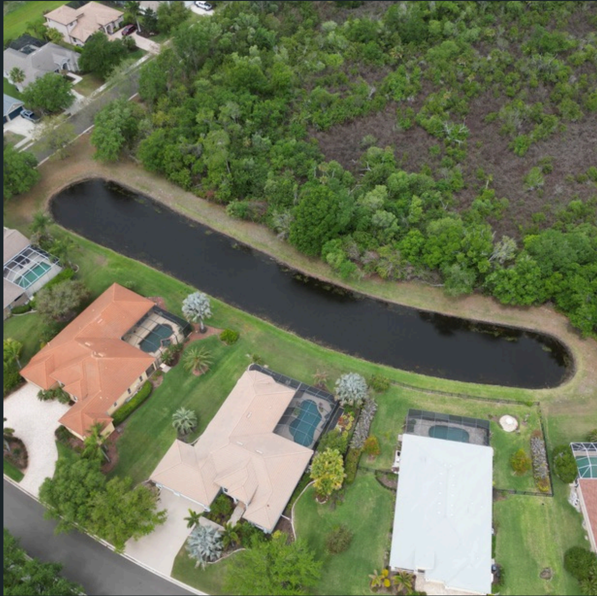
Pond #5 Treated for Shoreline Vegetation.