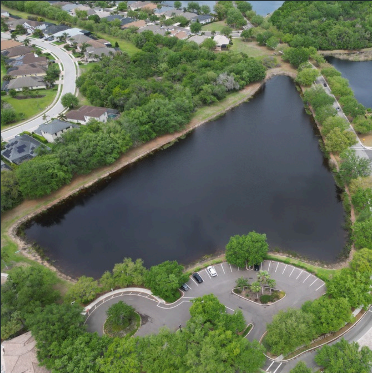
Pond #11 Treated for Algae and Shoreline Vegetation.