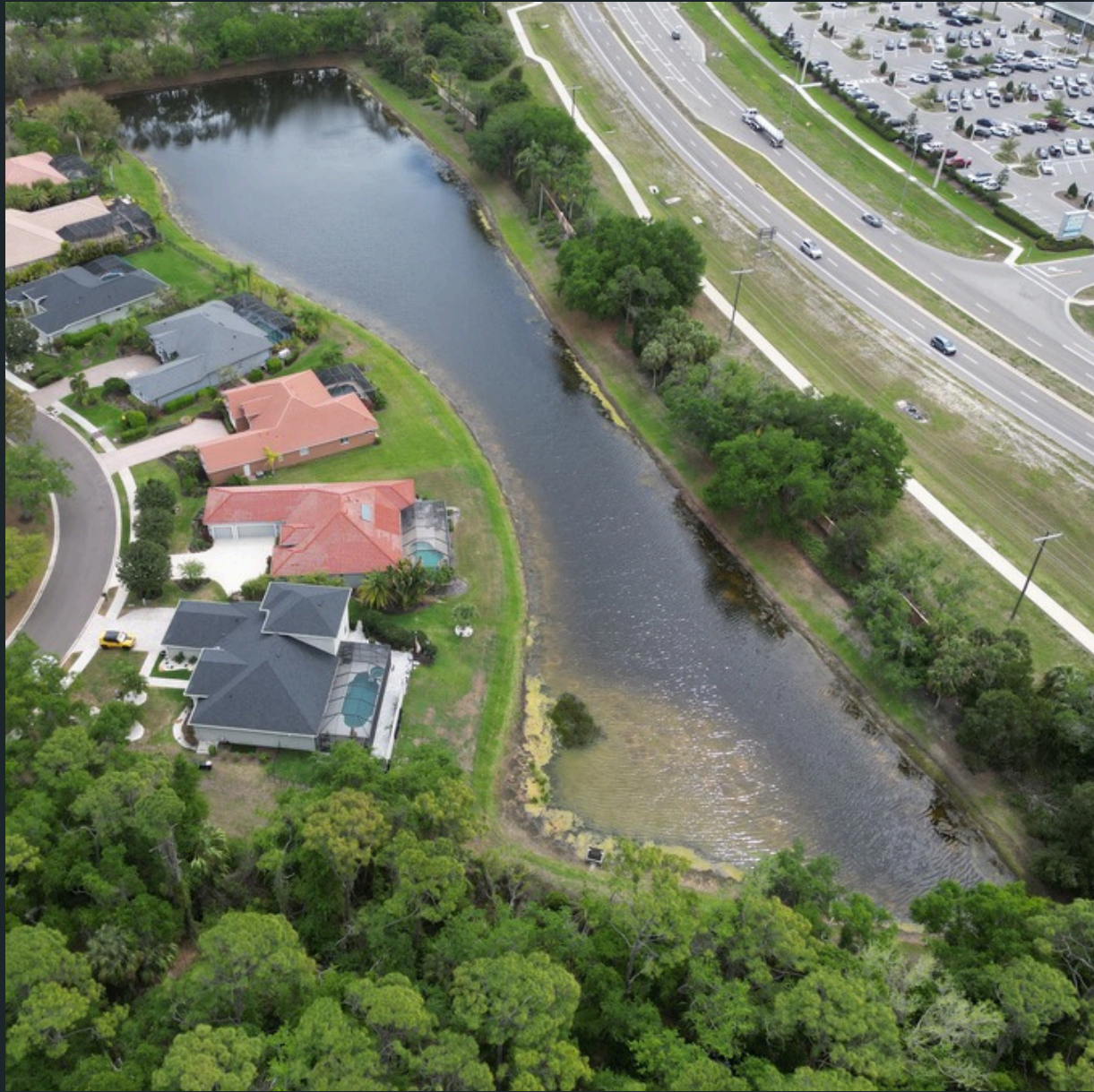
Pond #1 Treated for Algae and Shoreline Vegetation.