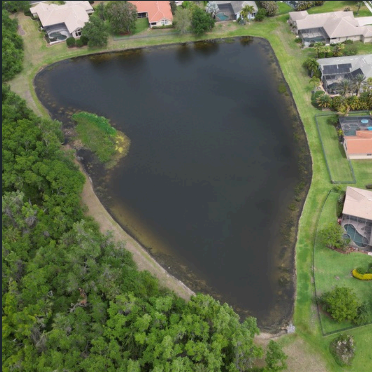
Pond #20 Treated for Algae and Shoreline Vegetation.