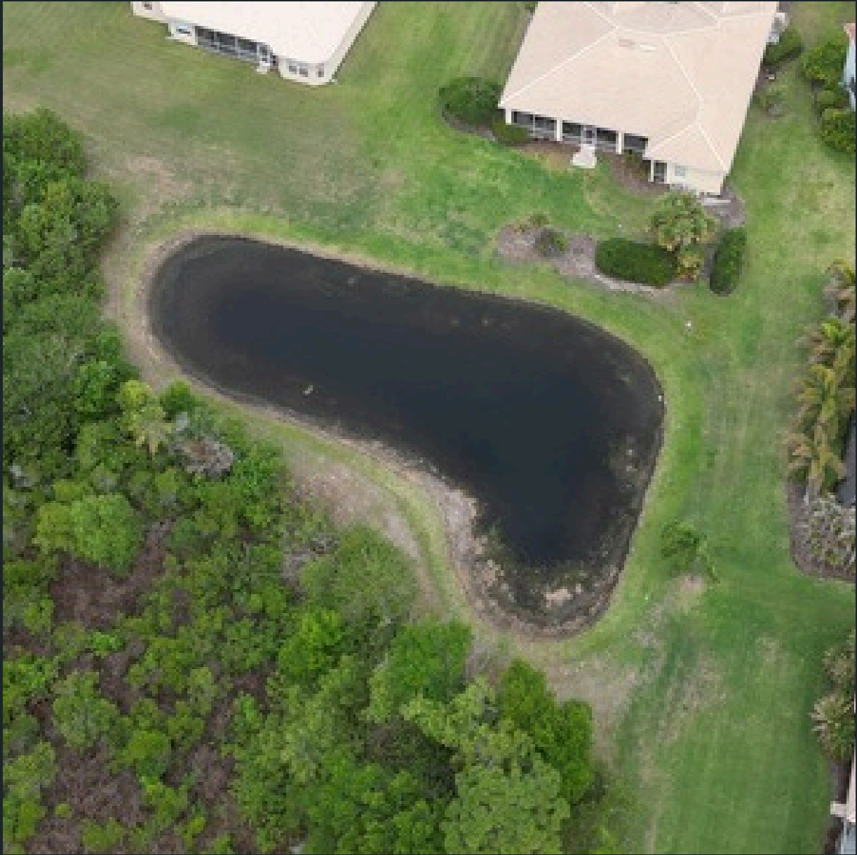
Pond #7 Treated for Algae and Shoreline Vegetation.