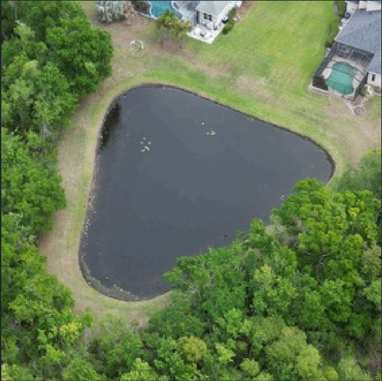
Pond #10 Treated for Shoreline Vegetation.