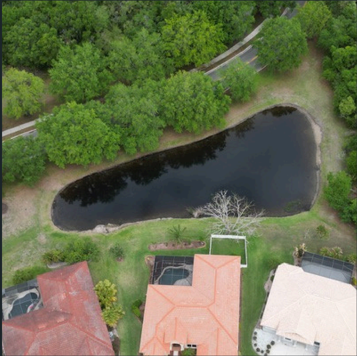
Pond #9 Treated for Algae and Shoreline Vegetation.