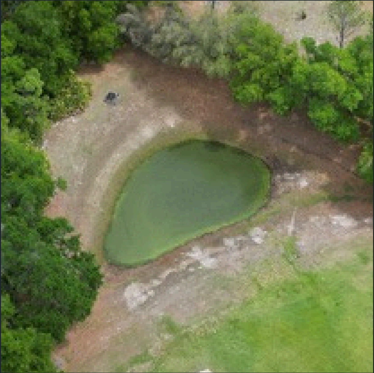
Pond #3 Treated for Algae and Shoreline vegetation.