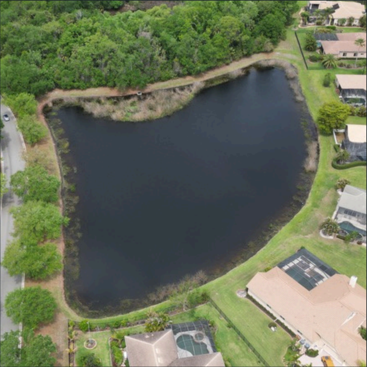
Pond #12 Treated for Shoreline Vegetation.