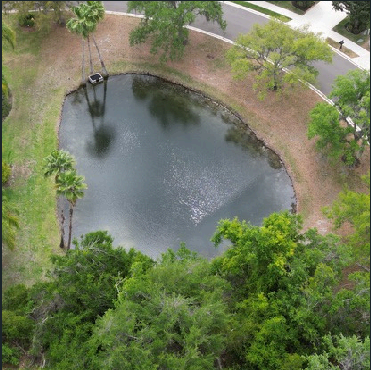
Pond #2 Treated for Algae and Shoreline Vegetation.